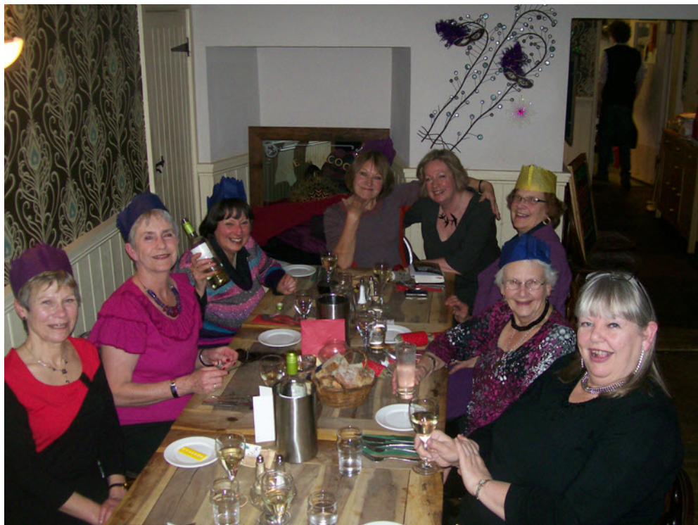
Reading Group Christmas Lunch